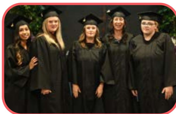
Day Class 2023